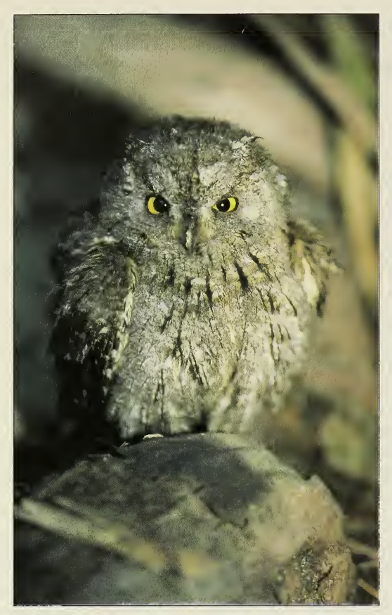
Eurasian Scops Owl Otus scops , Aride Island, Seychelles, December 1996 (Adrian Skerrett)